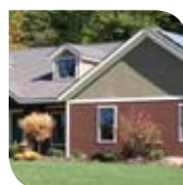
ICF HOUSE: FEATURED ON EXTREME MAKEOVER: HOME EDITION