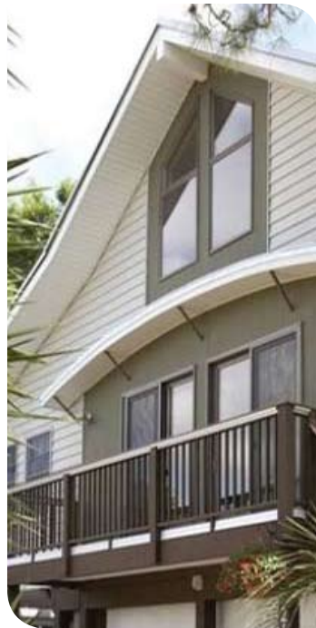
INSULATED VINYL SIDING COMBINES TWO HIGH-PERFORMANCE MATERIALS FOR DURABILITY AND ENERGY EFFICIENCY.