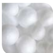
LABORATORY TESTING DEMONSTRATES EPS PERFORMANCE