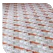
EPS RADIANT FLOOR HEAT PANELS